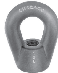
Drilled & Tapped